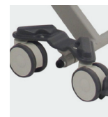
75mm Dual Castors