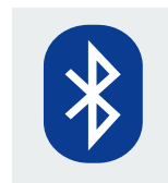
Bluetooth *handset must be ordered separately*