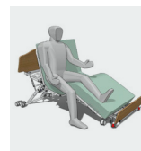
Chair Position push of a button

The Staebel EN7 Floorline Bed is one of the lowest beds available on the market and designed for intensive use. The bed lowers to floor level to prevent injuries and accidents caused by falls from beds. All actuators and mechanisms are concealed beneath the platform, allowing the bed to be constructed with no end pedestals! This allows visibility for users, and nursing staff access for procedures.