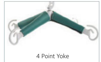
4 Point Yoke