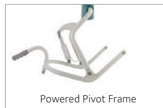
Powered Pivot Frame