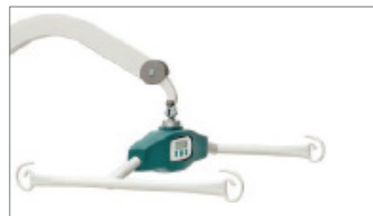
Bariatric 4 Point Yoke with Integrated Scale