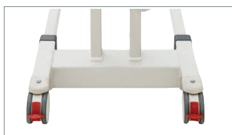
Concealed Electric Leg Spread Mechanism