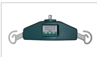
2 Point Yoke with Integrated Scale