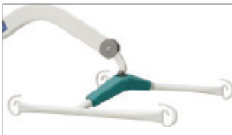
Bariatric 4 Point Yoke

FORTE 320 is the lifter of choice for institutional use where a high capacity bariatric lifter is required.